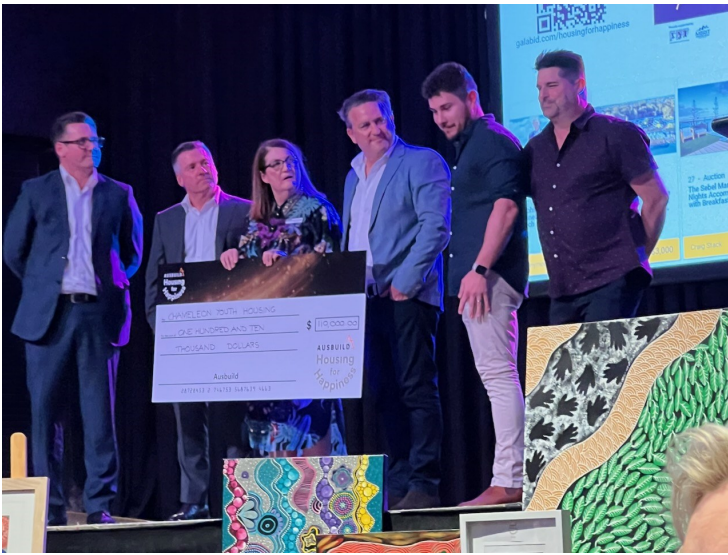
Fundraiser for Chameleon house raised $110,000 towards a new home for homeless youth .