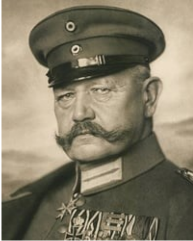
German President and WWI General